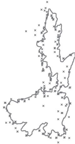
Fig. 2. Inference of hubs

The cartographic line that we try to infer consists of 6595 links (edges) and 6607 hubs (vertices). The edges have a length of 4041 pixels, as the reference system is in pixels. Sampling of eye tracking data is at 60 Hz (0.017 sec). Data comes from 3 different users with a total length of 89880 pixels ( Fig. 1 ). Following the various stages of the polylines inference algorithm, the following output is produced. During the first phase, i.e., hubs extraction and connection, 109 hubs and 300 link samples are generated. The second polylines inference phase, i.e. compacting links, produces 119 hubs, 79 links and a length of 2990 pixels. This result shows that during the second phase of the algorithm, the number of hubs remains largely constant but only the length of the links connecting them is significantly reduced since we radically merge links during this phase. Fig. 3 visualizes the inferred polylines in blue and the actual cartographic data in grey color.